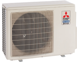
Outdoor Unit: PUY-A12NHA6 (-BS)